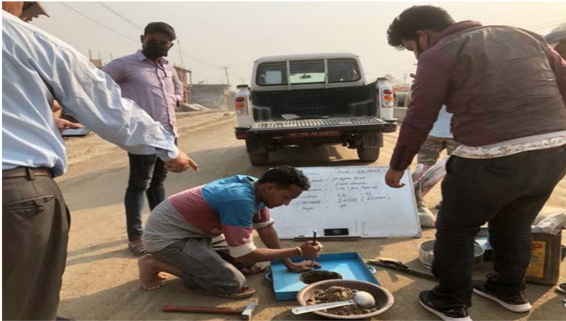
Conduction of Field Density tests of Base course, Birgunj