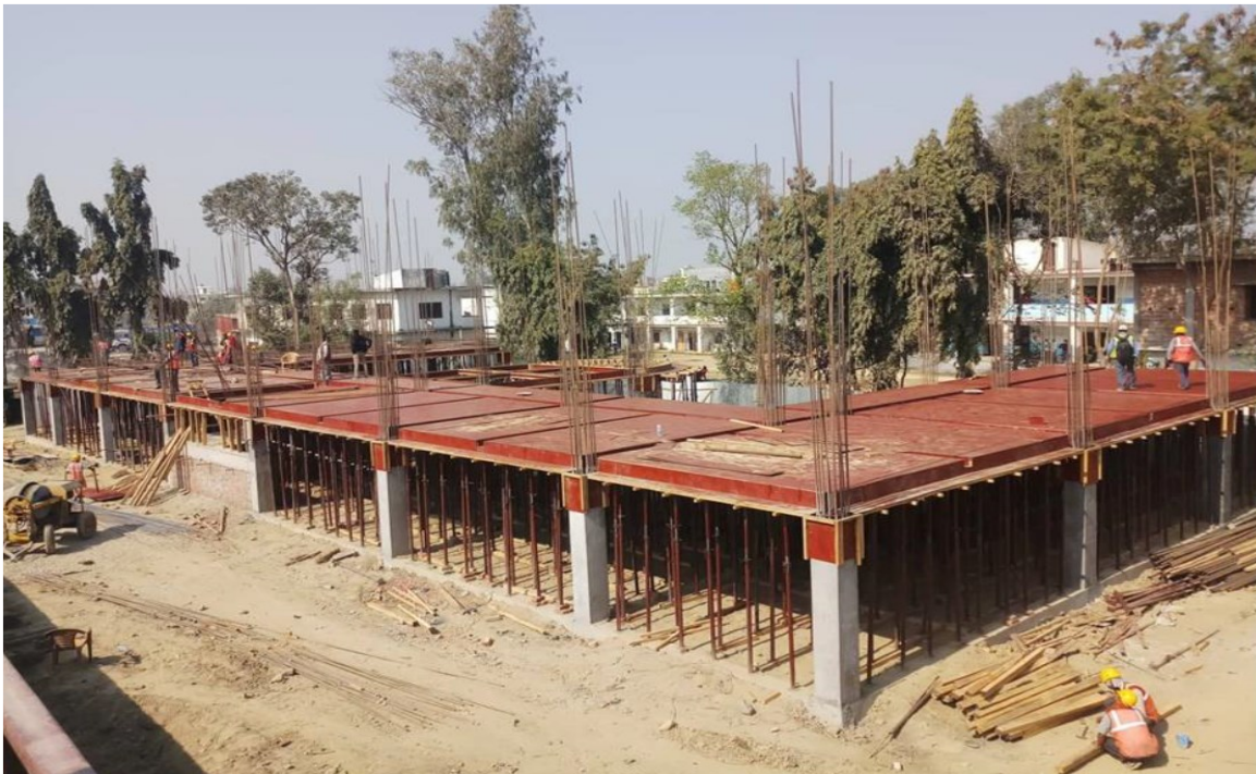
Construction of School Building on progress, Birgunj