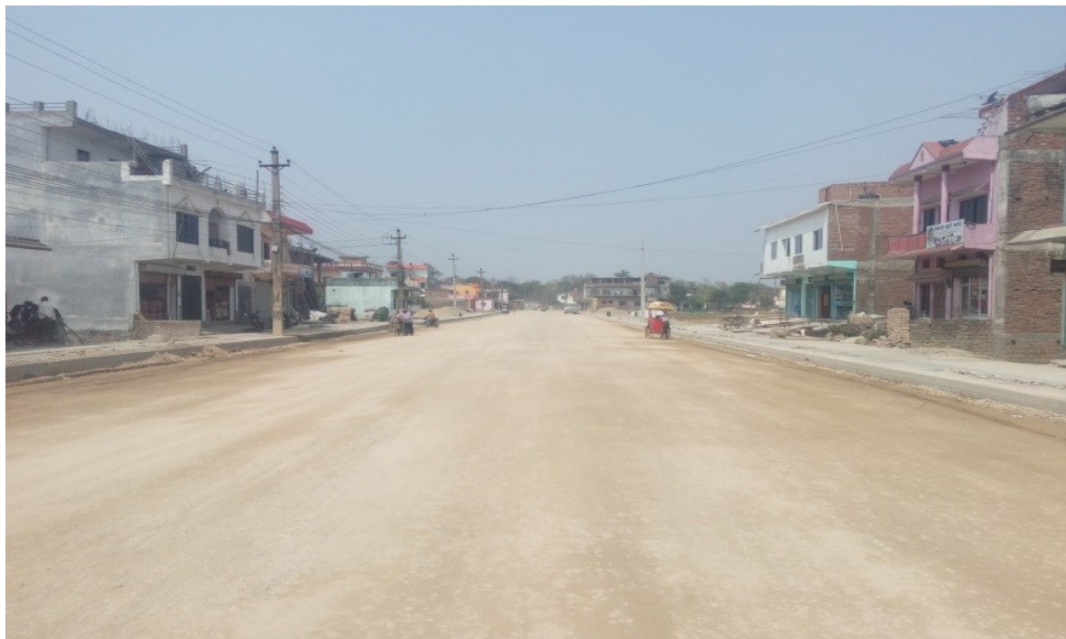
Base course laying of stadium road, Siddharthanagar