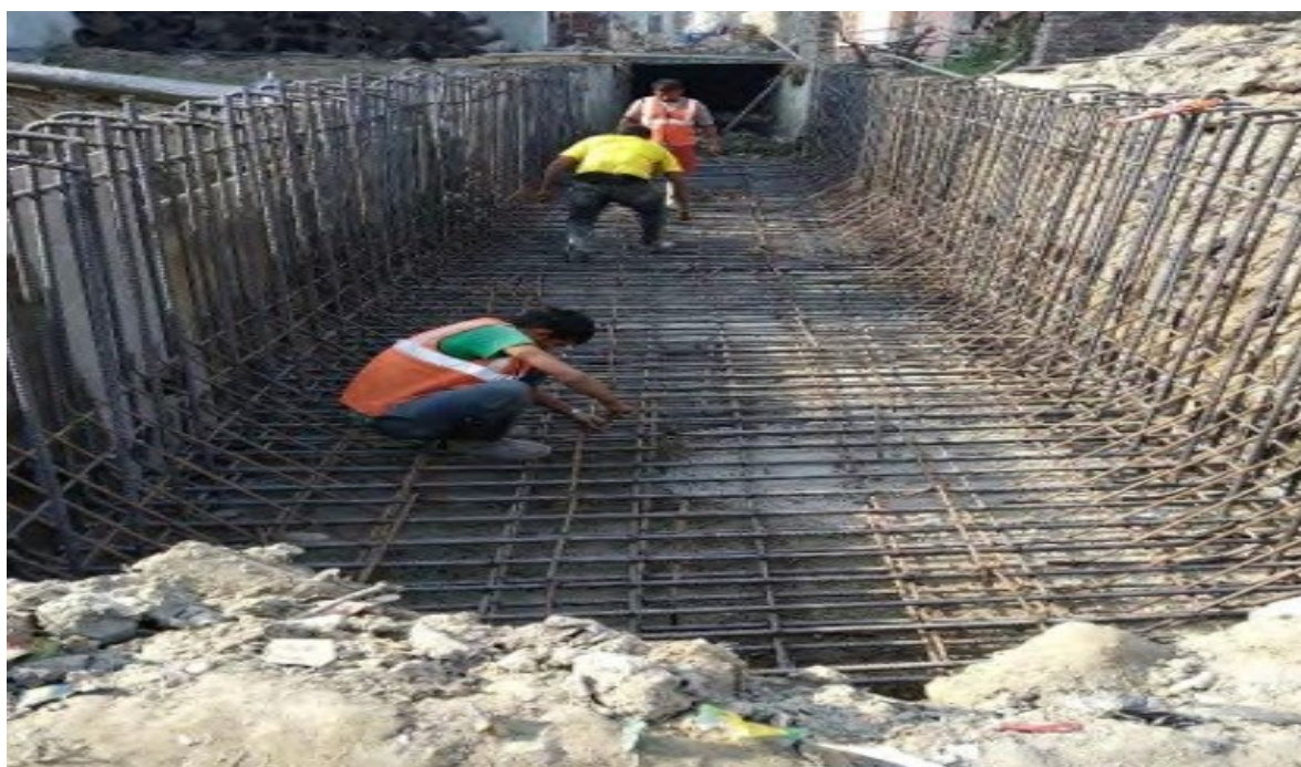
Re-bar erection work for Changbari Nala, Biratnagar