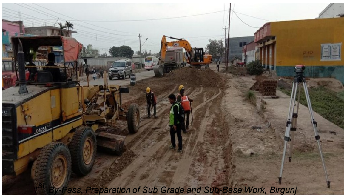
1 st By-Pass, Preparation of Sub Grade and Sub-Base Work, Birgunj