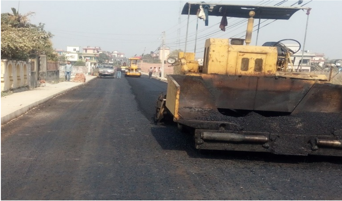
Laying and compaction of Asphalt concrete work at Kailash path, Siddharthanagar