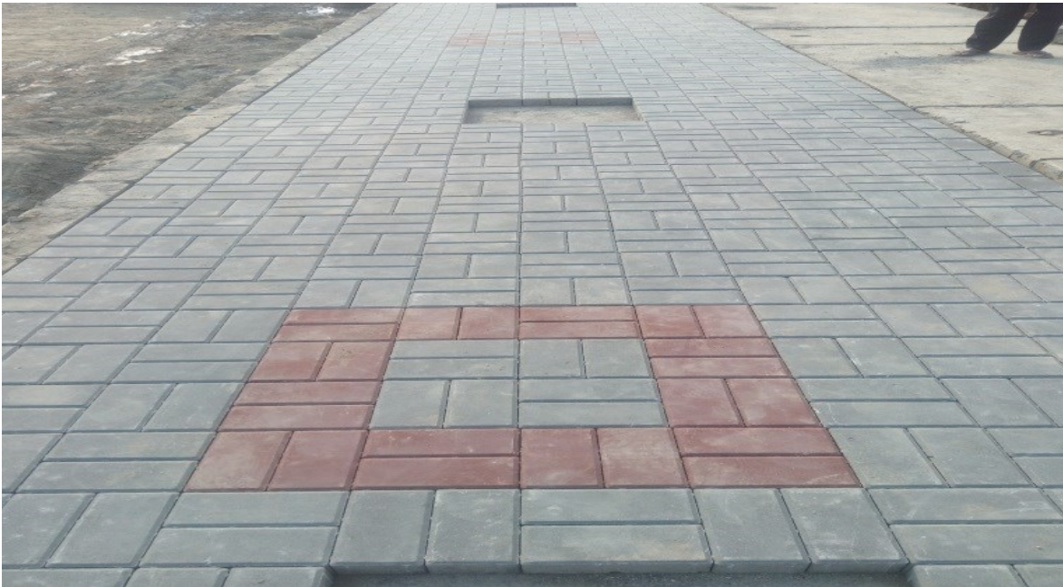
Footpath construction at Bimanghat road, Nepalgunj