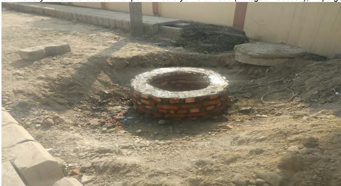
Raising of Sewer Manhole to achieve required design level at R77, Biratnagar