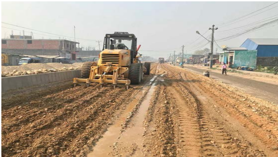
1st By-Pass Road, Sub-base grading Work, Birgunj