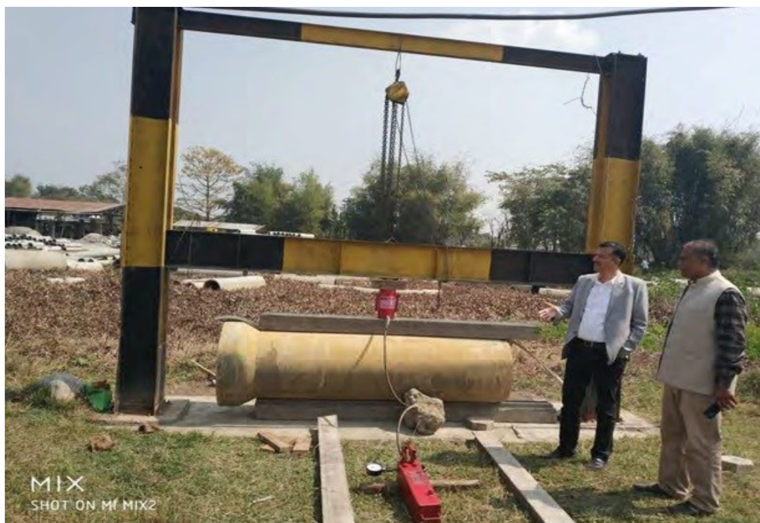
Three Edge bearing Test of Hume/RCC pipe, Biratnagar