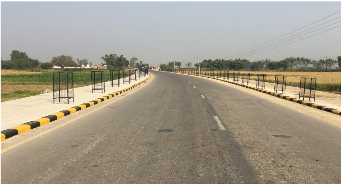
Completed Road Section at Ganeshman Singh Chowk to Paraspur Road, Nepalgunj