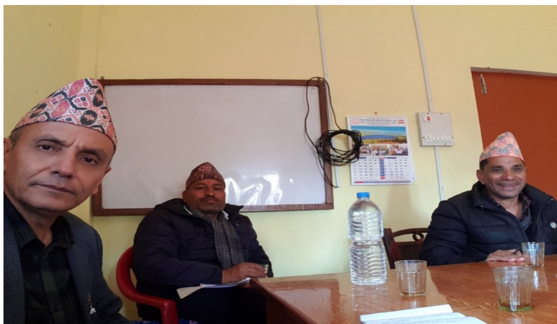
PMC, DTL/Municipal governance Expert discussing on PBSEDP with Mayor, Suklaphanta.