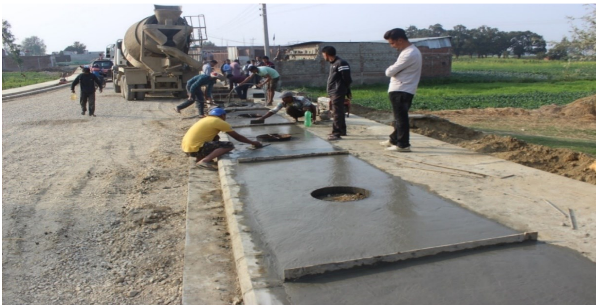
Footpath concrete work in progress at Ganeshman Singh Chowk to Paraspur Road Nepalgunj