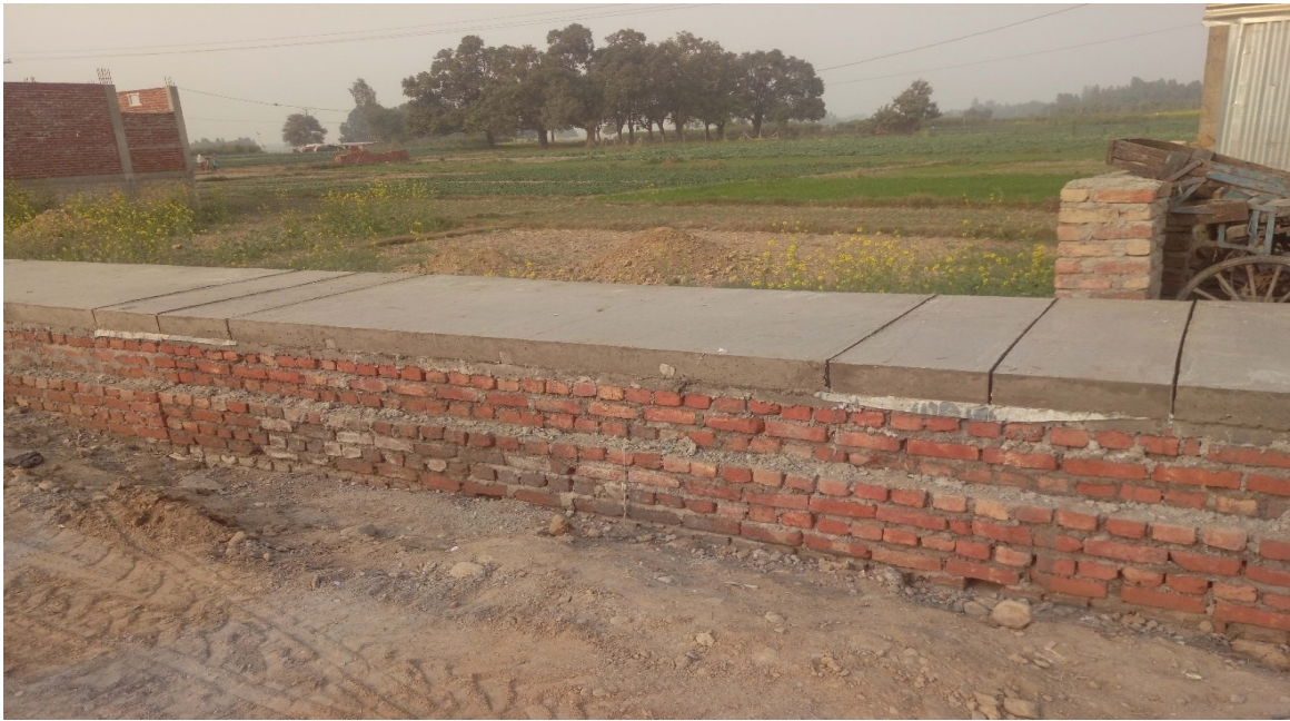
Drain Covered Slab, Ganesh man Chowk, Siddharthanagar