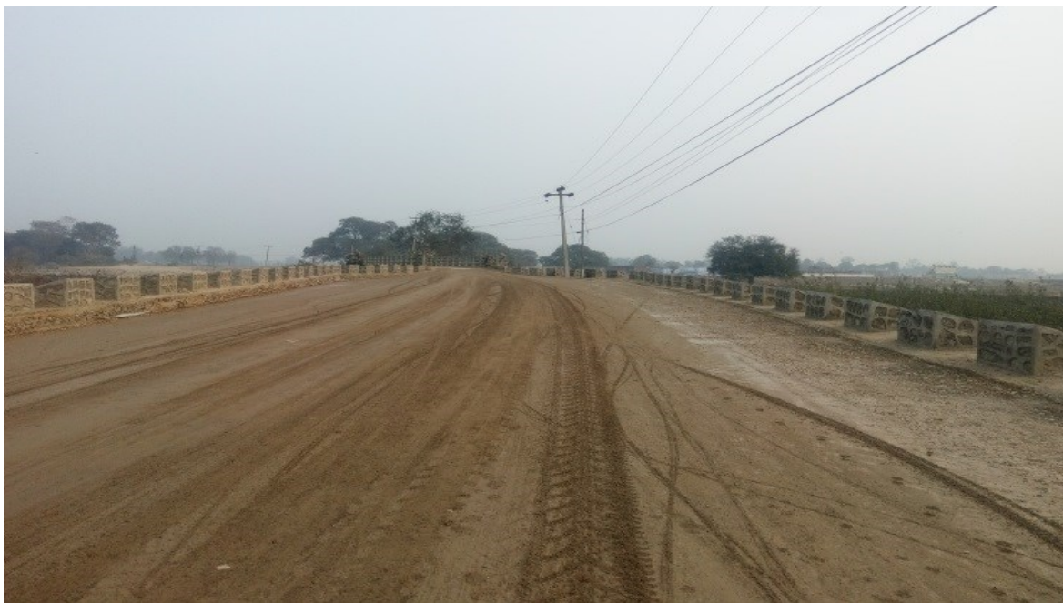
Base course at Sima Path, Siddharthanagar