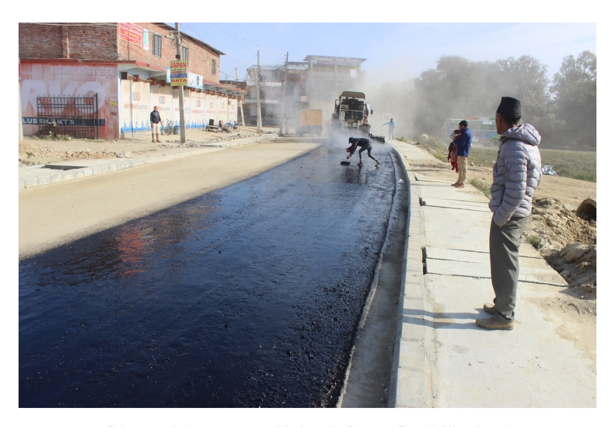
Prime work in progress at Karkanda-Bypass Road, Nepalgunj