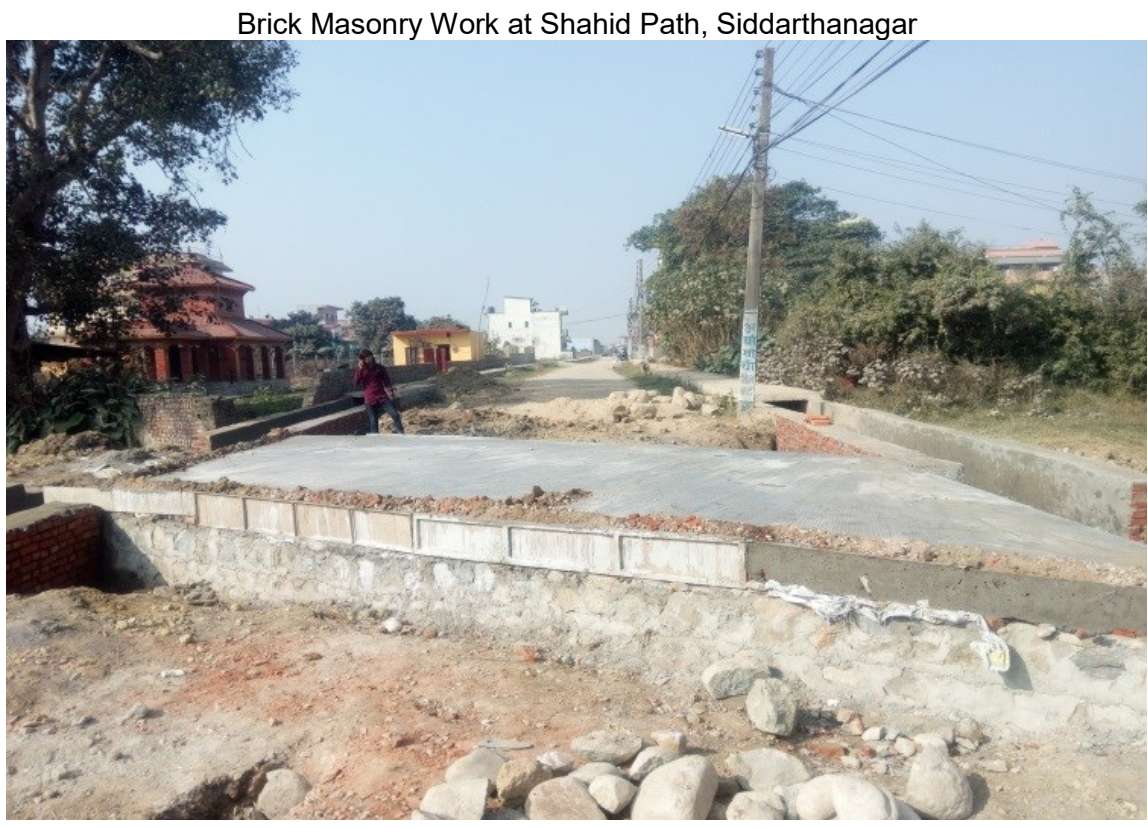
Slab Culvert work at Durga Colony road, Siddarthanagar