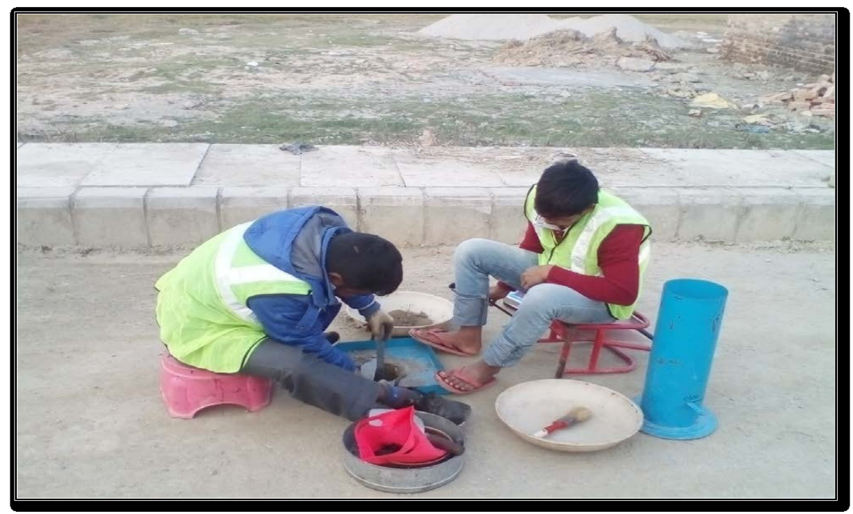
Field Density test at R3 (Dharamban Road), Biratnagar