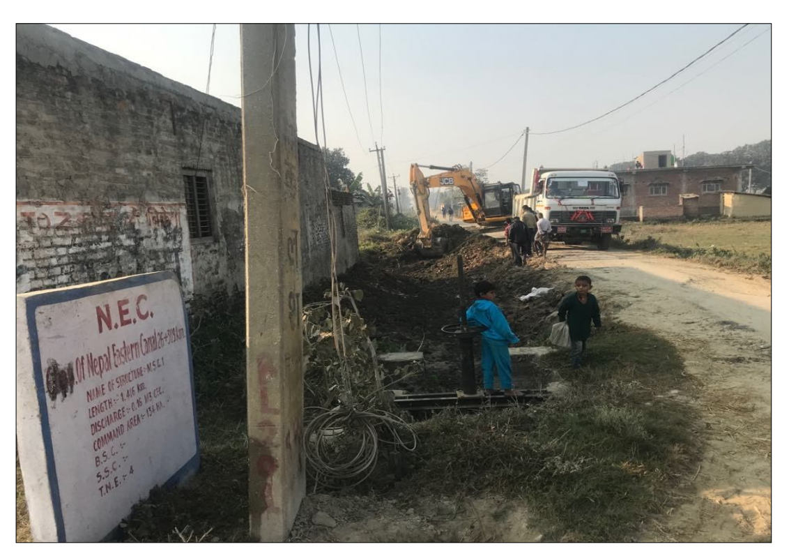
Clearance of ROW, Birgunj