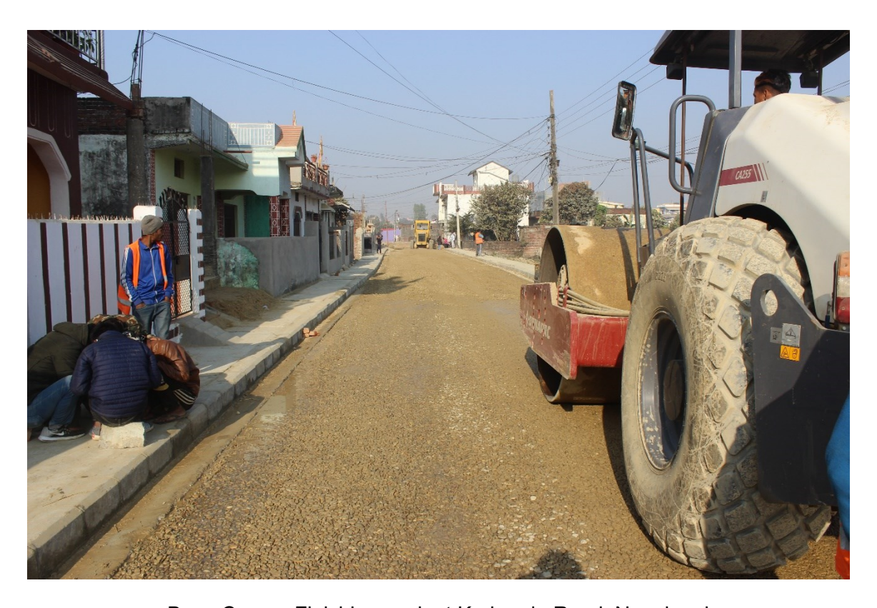
Base Course Finishing work at Karkanda Road, Nepalgunj