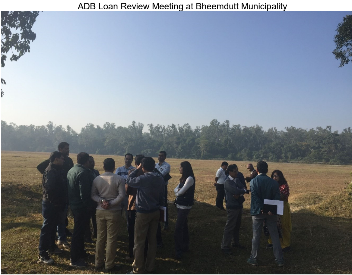
Dhangadi ISWM site visit by ADB loan review mission