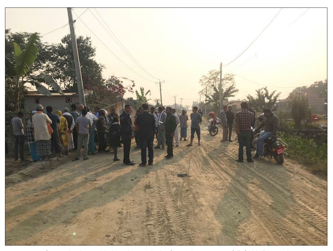
Consultation with local people before clearance of ROW, Birgunj