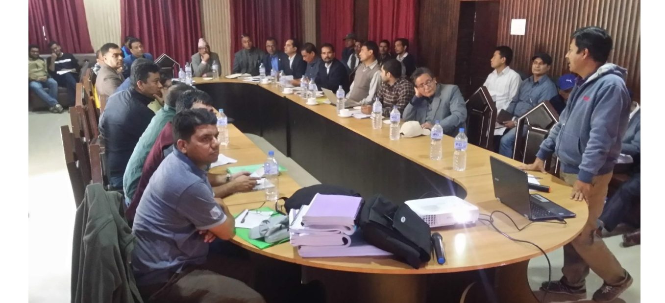
ADB Loan Review Meeting at Godawari Municipality