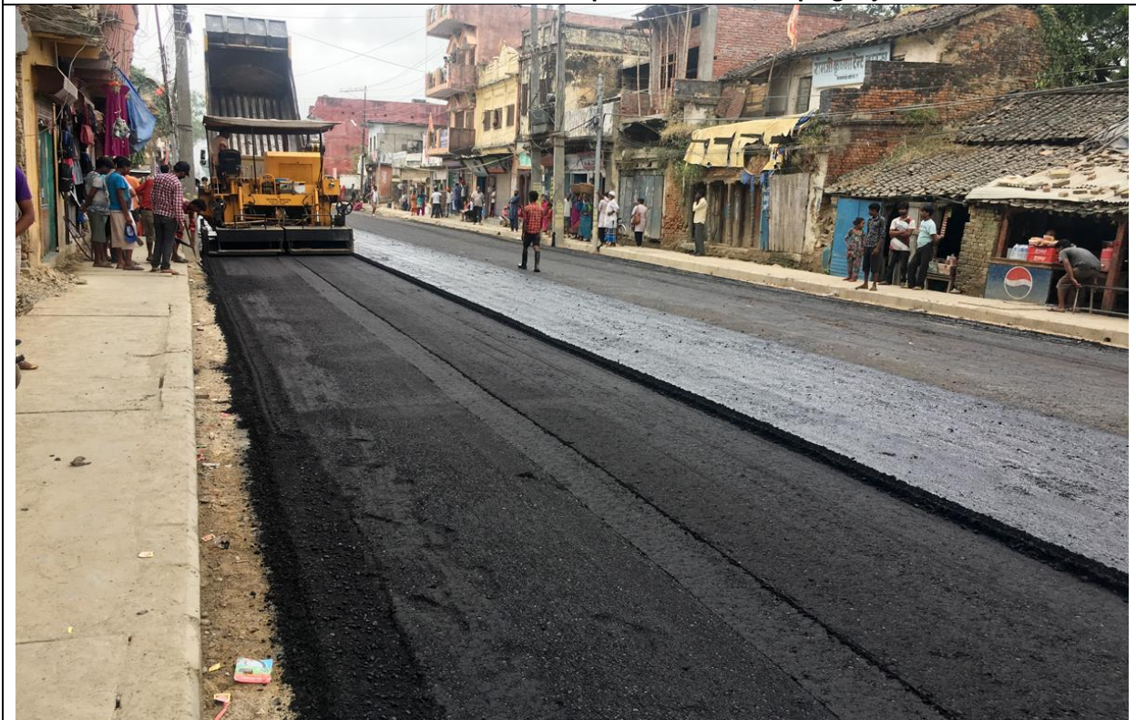
Asphalt concrete work at Charbahini to Nagarbhawan Road, Nepalgunj