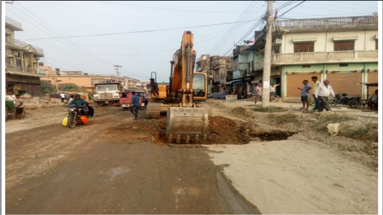
Removing unstable soil from Bimanghat road, Siddarthanagar