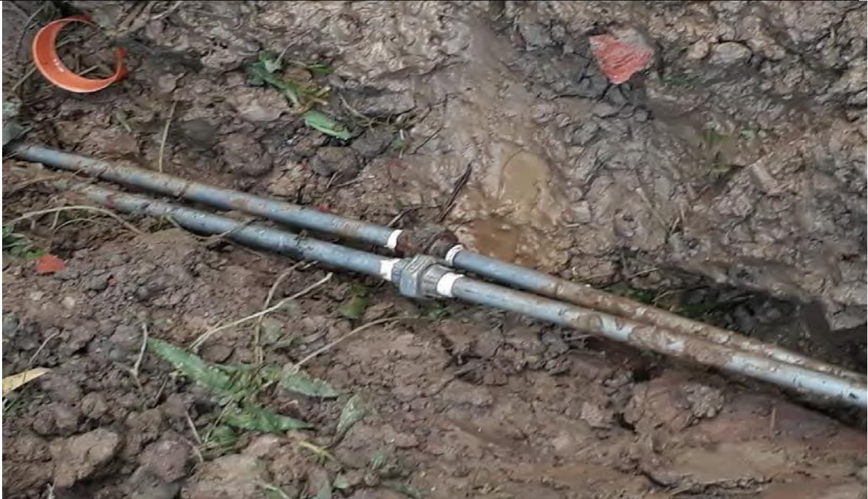
Relocation of water supply pipes, Biratnagar