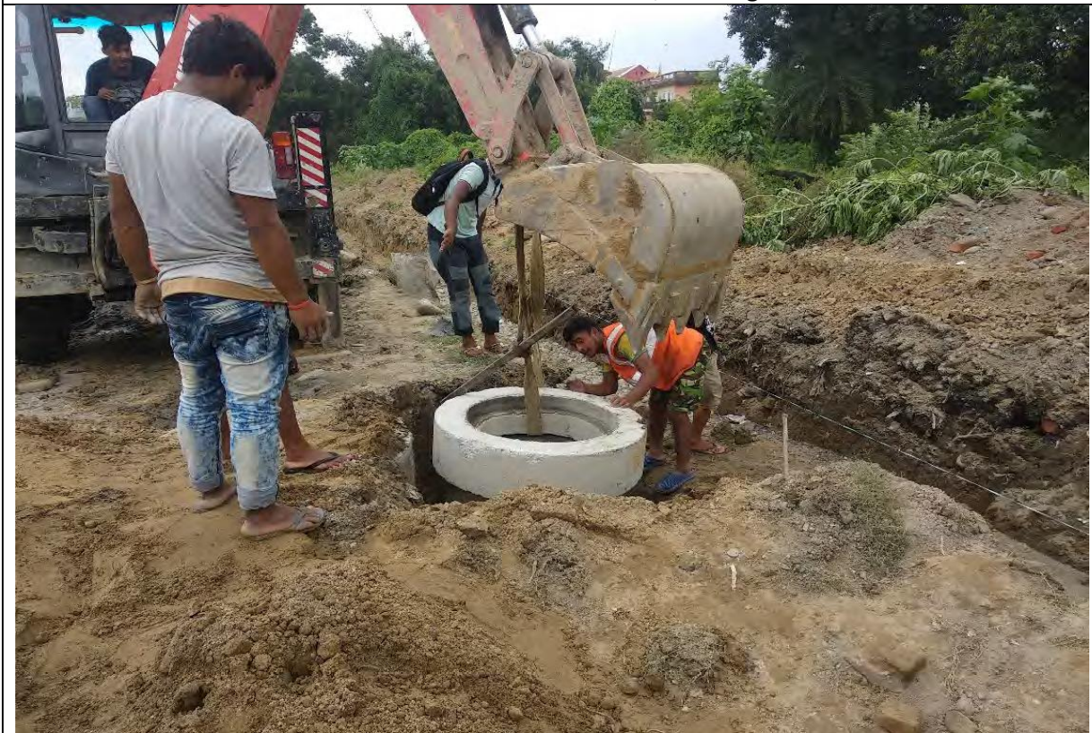
Sewer inlet works, Biratnagar