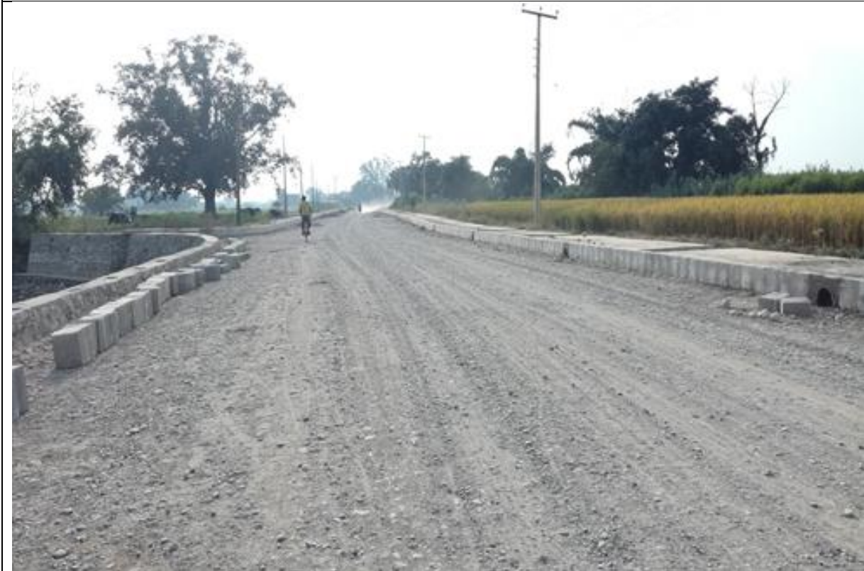
Kerb stone laying for Goniya Road, Siddarthanagar