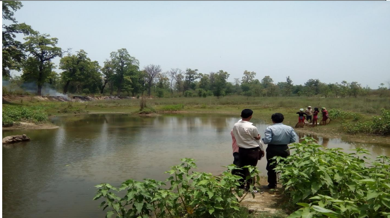
Ponding of water in proposed ISWM Facility of Godavari Municipality