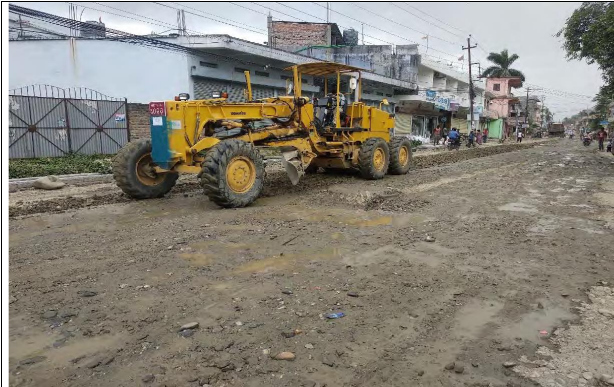
Sub-base work at Main Road, Biratnagar