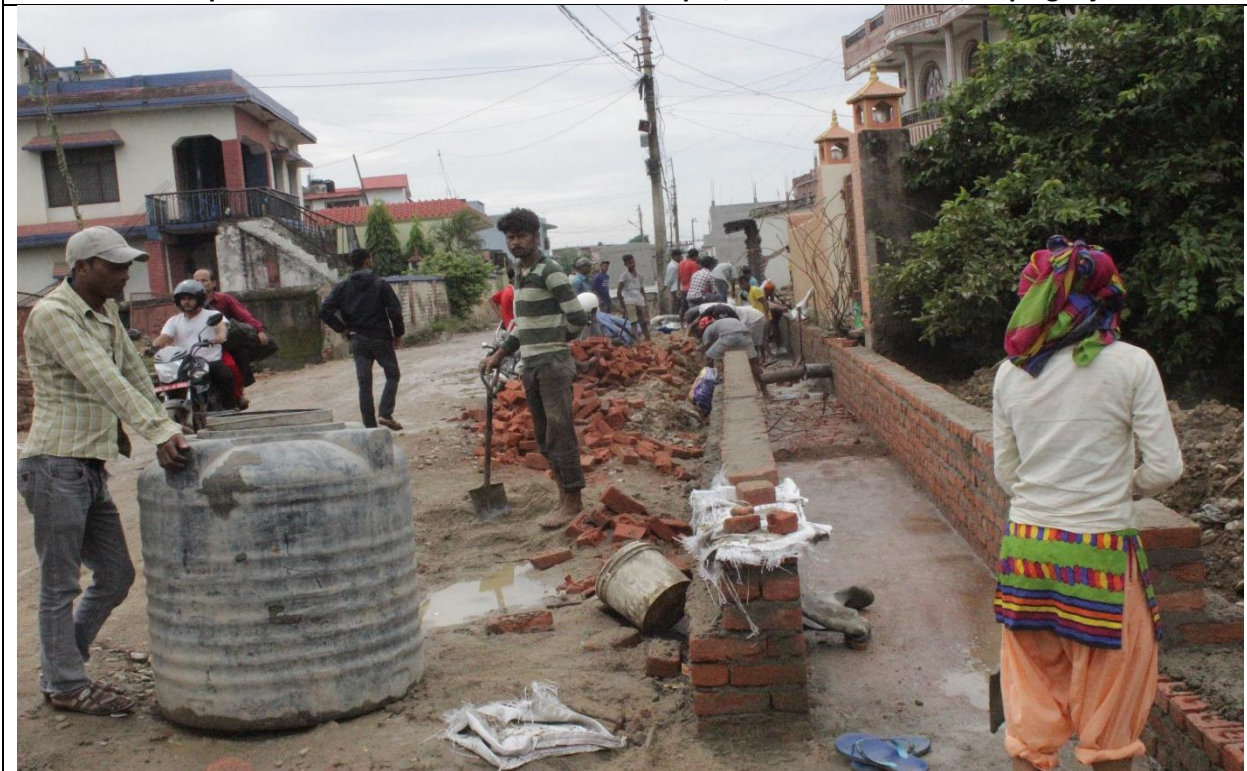
Brick masonry drain construction work (Karkando to Bus park Road), Nepalgunj