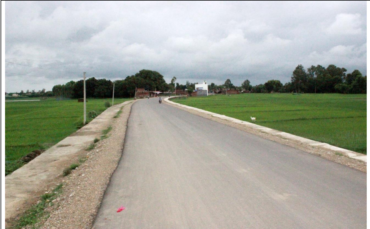
Completed Road and Drain Section at Paraspur, Dondra Nala Road, Nepalgunj