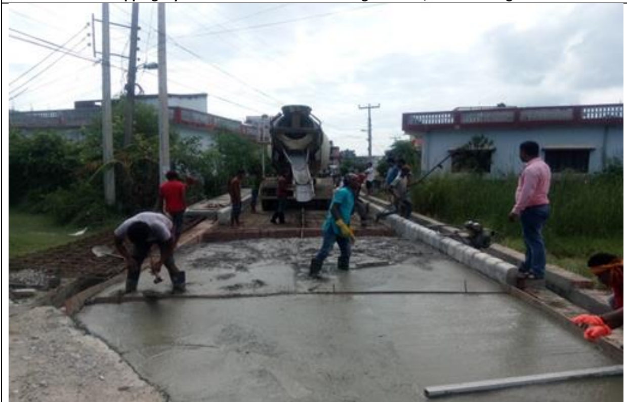
RCC Pavement at Rudra Path, Siddarthanagar