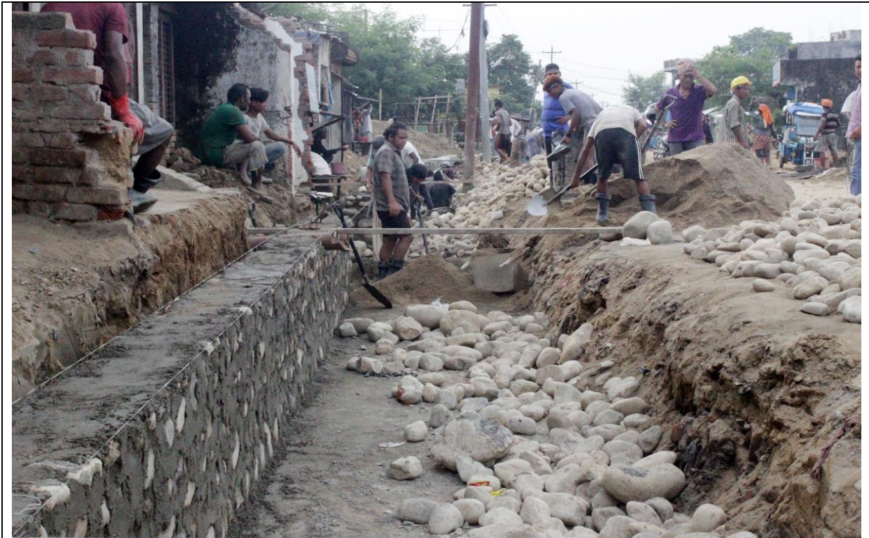
Drain construction work at Rapti Khola Road, Nepalgunj