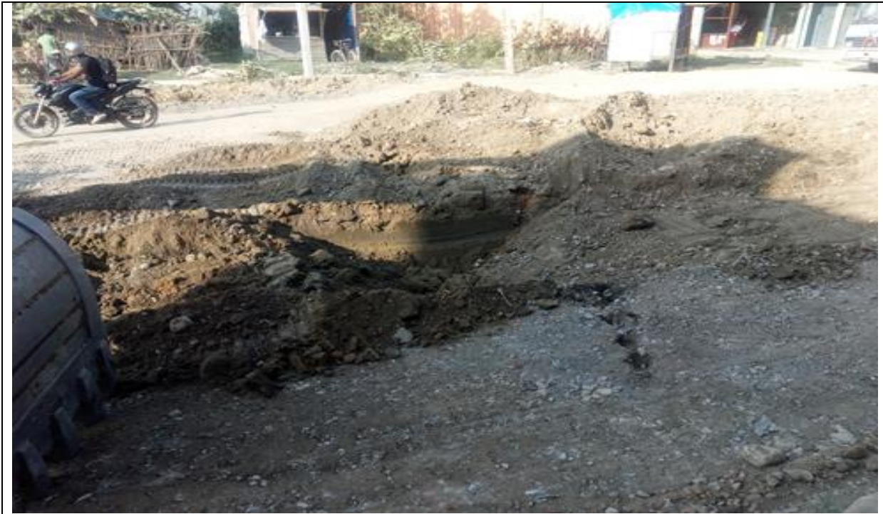
Capping layer for sub base course Bimanghat Path, Siddarthanagar