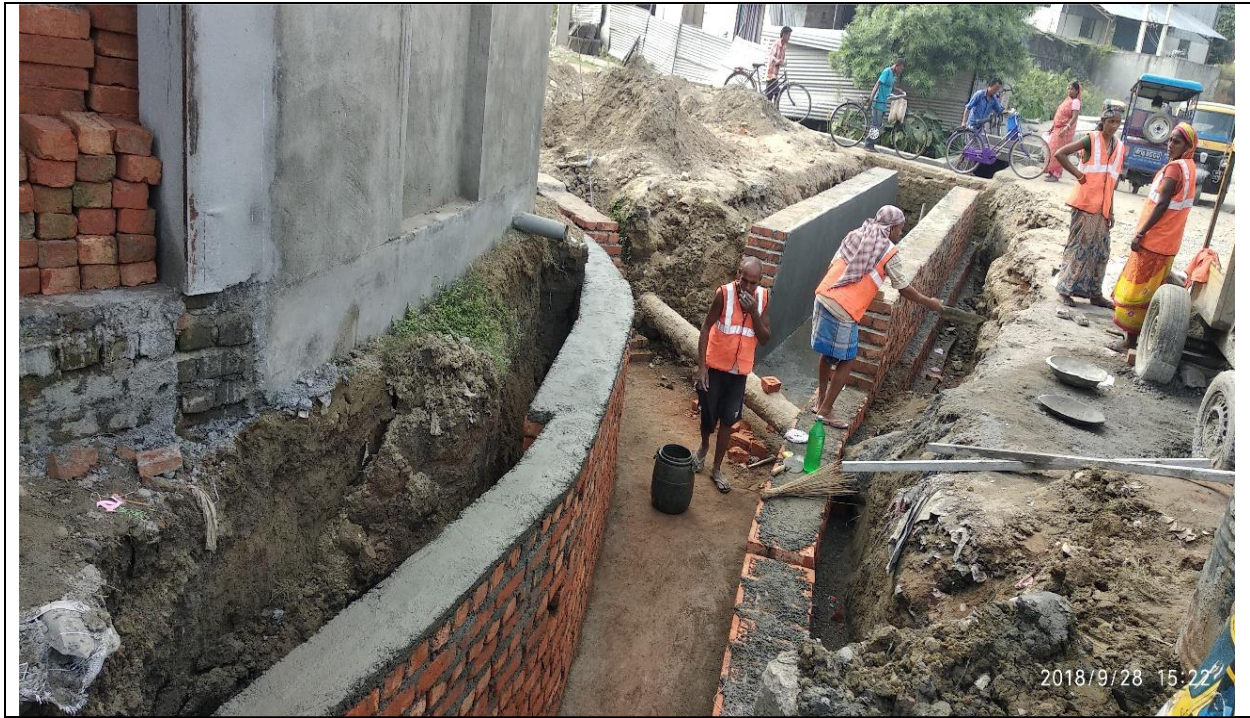
Drain crossing works at Rani, Biratnagar