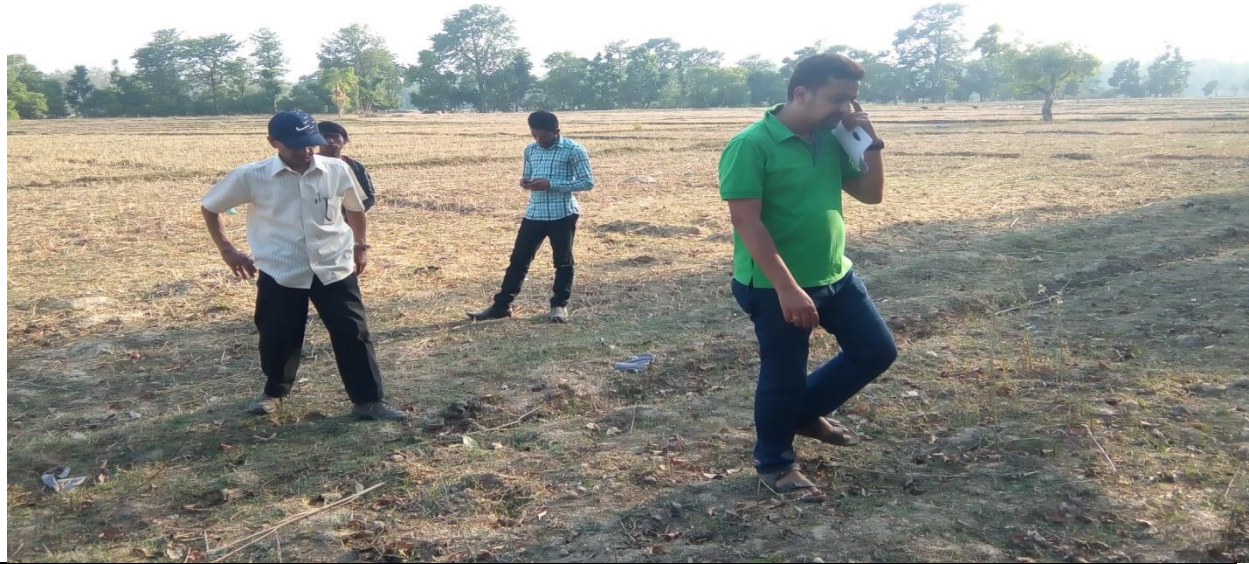
Visit to proposed ISWM Facility, Dhangadhi Sub Metropolitan City