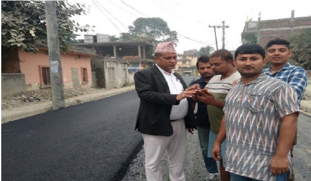
Mayor inspecting Asphalt work at R6, Biratnagar