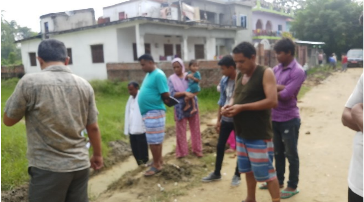
PCC Road, site clearance and Drainage works at Himali Tole – 20, Nepalgunj