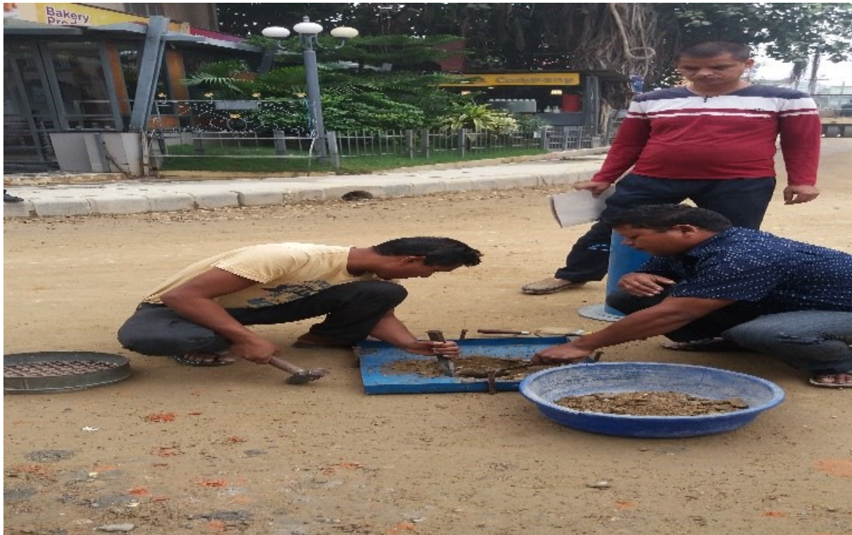
Density test for base course layer in Nagarpalika road, Siddharthanagar