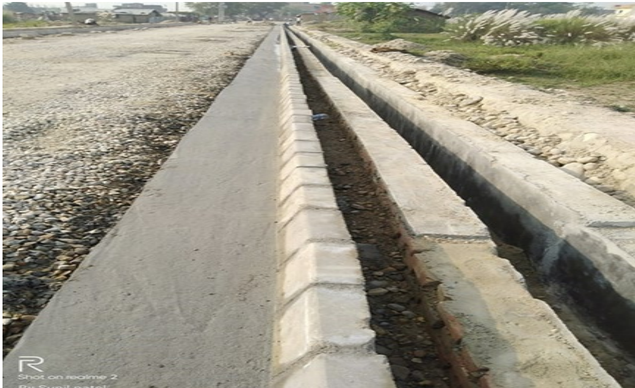
Kerbstone and tickdrain works at Radhemai and Canal road, Birgunj