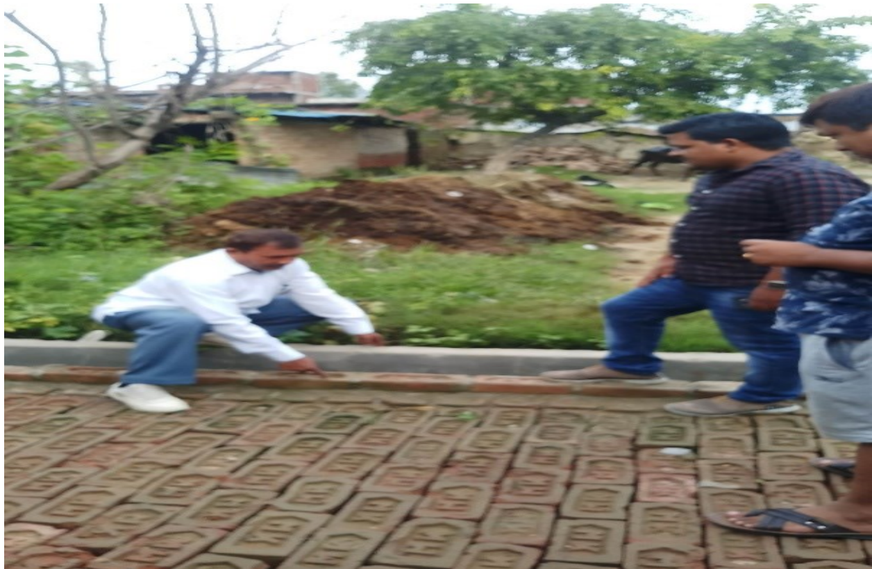
PCC Road Brick Soling work at Karkando Lagdahaba Tole-18, Nepalgunj