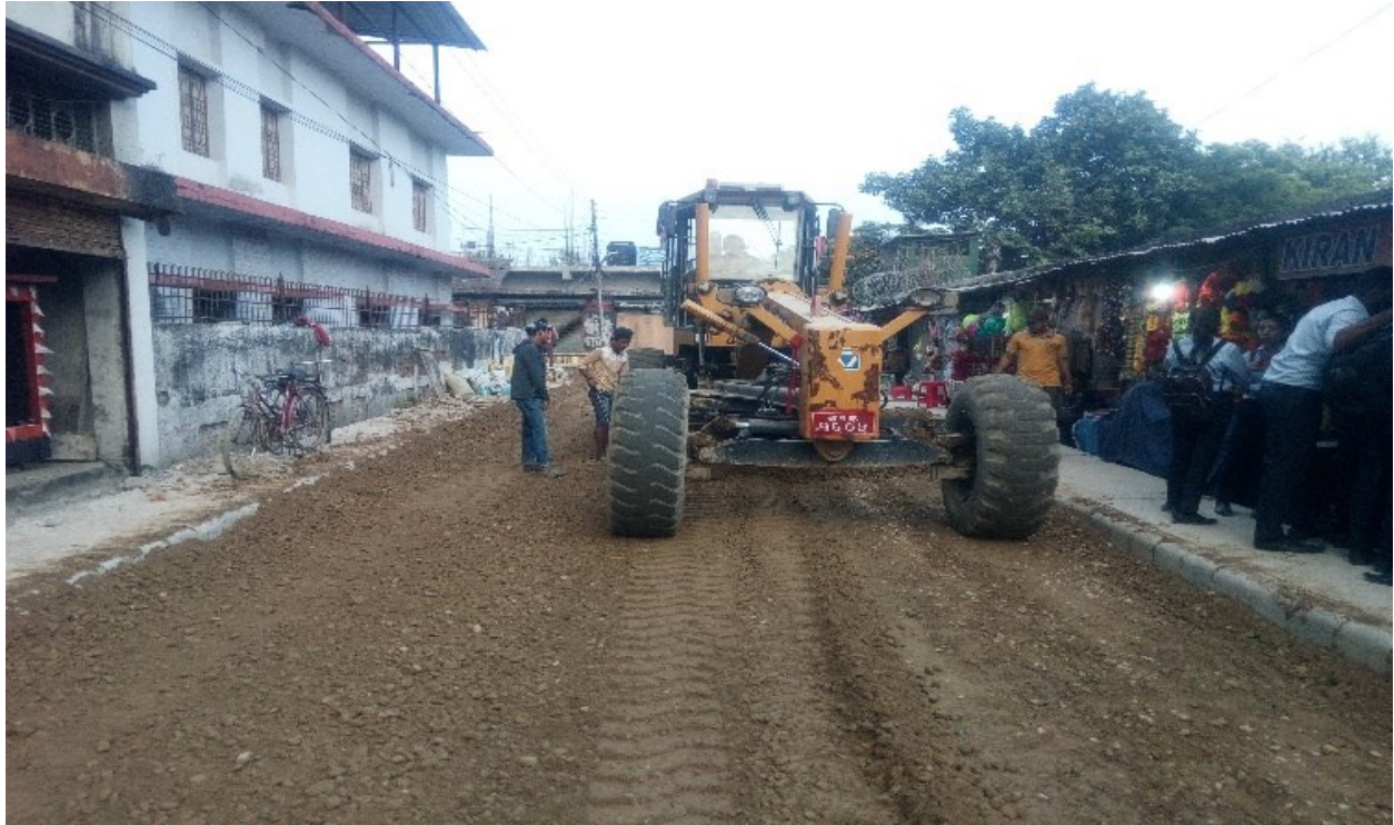
Base course layer in Nagarpalika road, Siddharthanagar