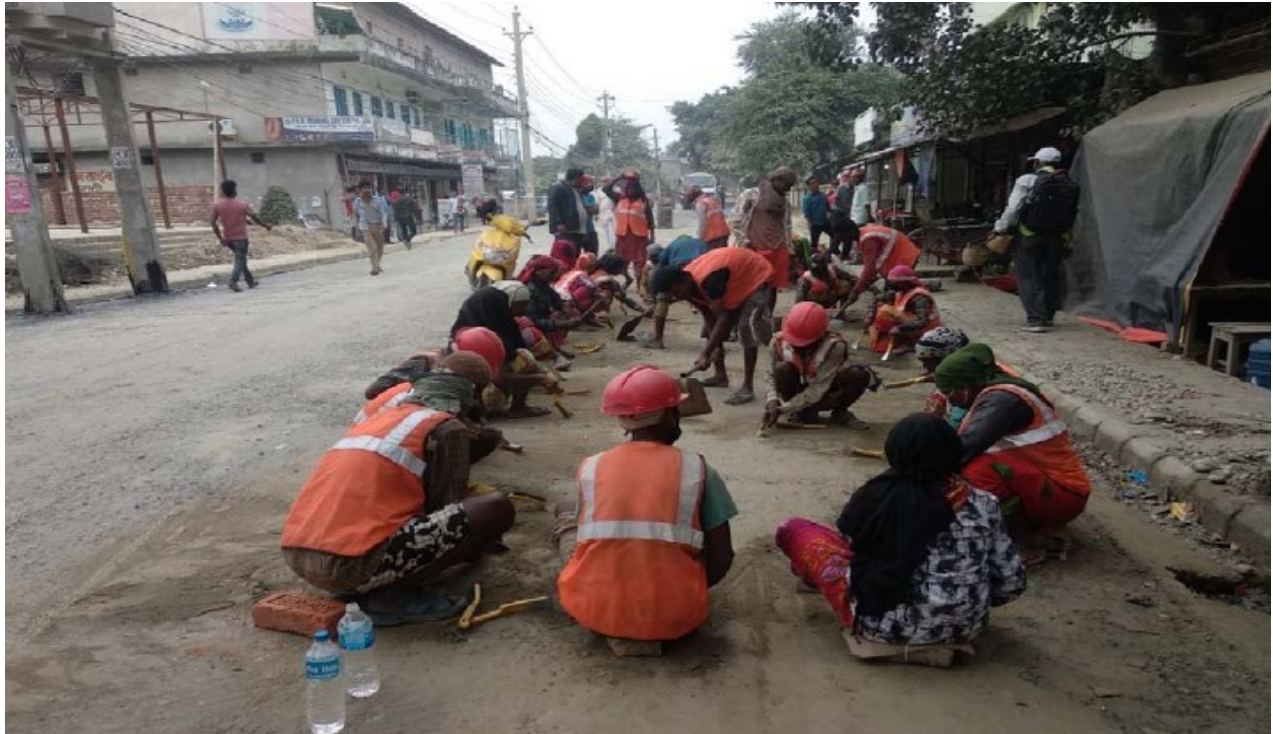
Brooming work at R41, Jahada Marga, Biratnagar