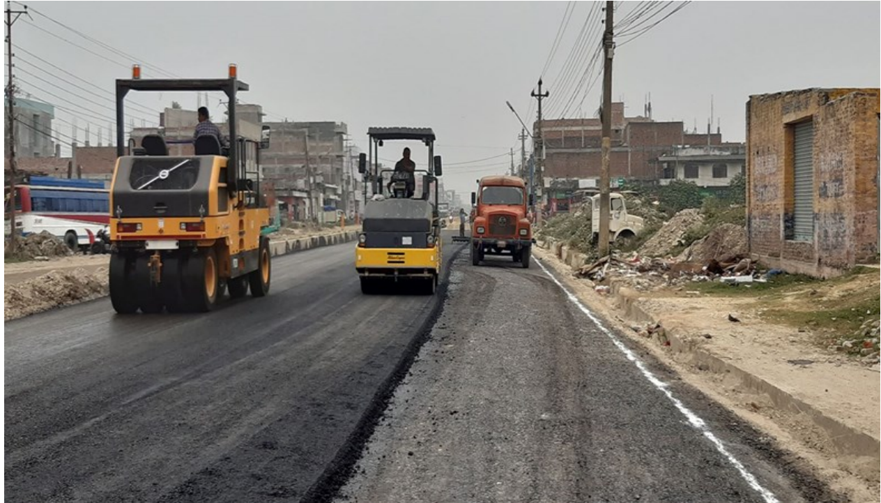
Pavement work at first Bypass Road, DBM works, Birgunj